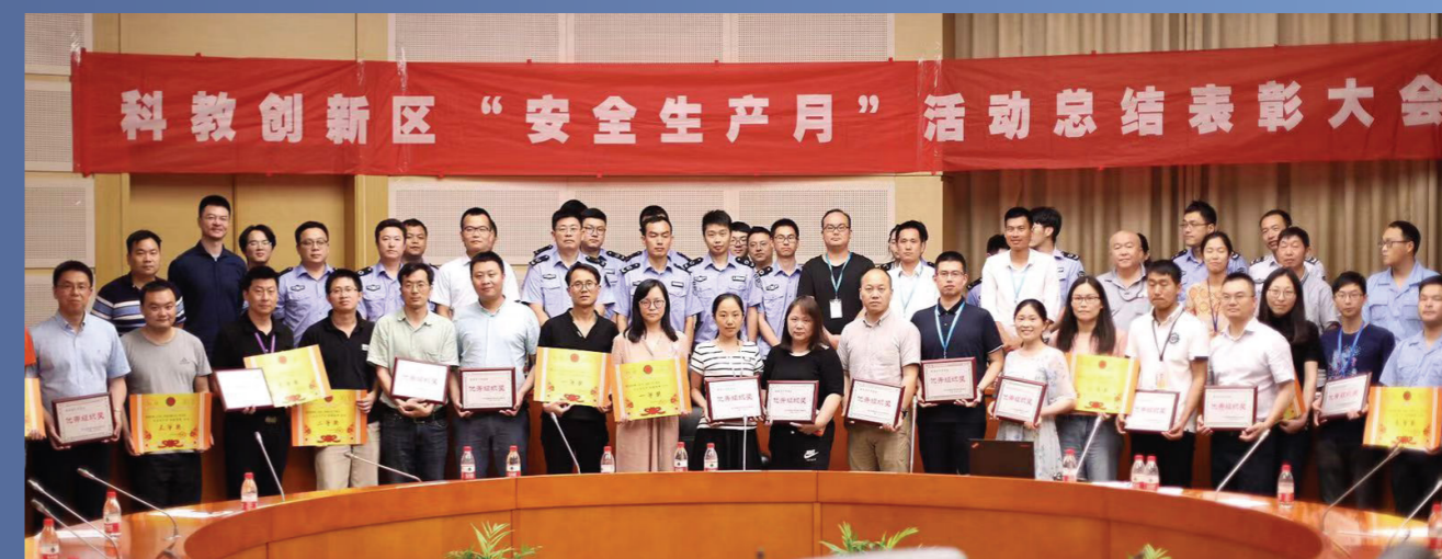
OSCAR was awarded the Outstanding Organisation Award in Safety by SEID in June 2019

Since the outbreak and subsequent of COVID-19 throughout China during January 2020, OSCAR administrative team responded promptly to check every OSCAR and onsite third-party staff's whereabouts and travel history, distributed KN95 masks to staffs in need and ordered disinfectants and protective supplies (e.g. medical masks, hand sanitizers, alcohol wipes). These measures, meeting and exceeding local guidance, were intended to safeguard OSCAR staff and minimise disruption. During the Chinese New Year Holiday, the administrative team also kept constant contact with staff by WeChat and email, including sharing official notices and prevention guidance, collecting travel plans and monitoring health status. Particular effort was made to share translated updates with overseas staff in English.